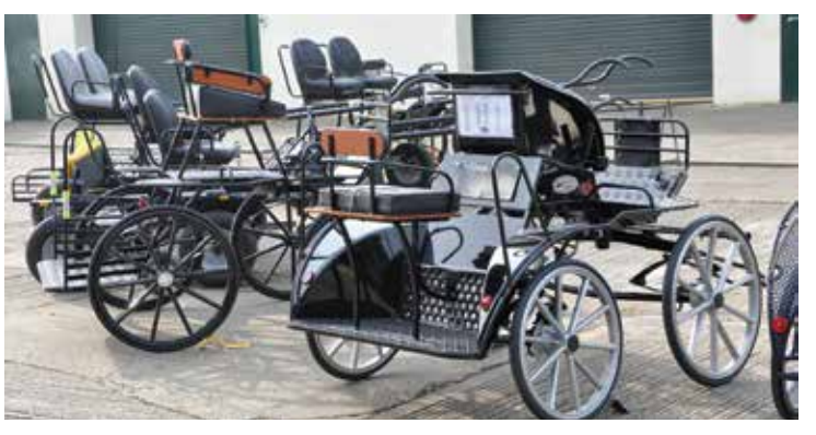
Carriages on display at a Bennington open day

"I am currently participating in indoor driving and intend to continue pleasure driving with my club, which is great for keeping my pony fit, and also do more training with one and two day events in mind.